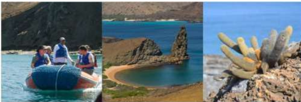
Pinnacle Rock, Bartholomew Island

You will head to Bartholomew Island where the famous Pinnacle Rock is found. Bartholomew consists of an extinct volcano with a variety of red, orange, black and even green volcanic formations. We will take a trail of stairs to the summit of the volcano (about 30 or 40 minutes) where you will enjoy one of the best views of the islands! A beautiful beach surrounded by the only vegetation is perfect for snorkeling where you may even see and swim with Galapagos penguins.